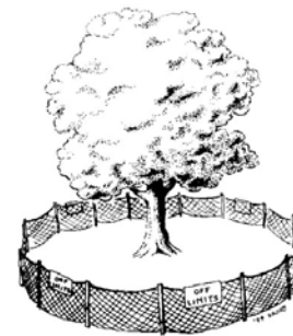
Figure 2. Protect the tree from damage by erecting construction limit fencing around the protected root zone.

The number of cuts near street trees may be reduced by a variety of methods and compromises. Trenches should be dug outside of the tree PRZ, or as far from the tree trunk as possible.