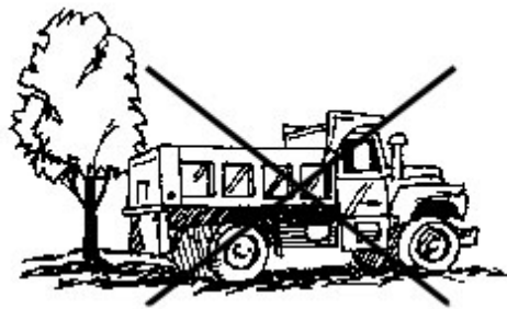
Figure 4. Avoid running heavy equipment over the protected root zone, which damages sensitive tree roots.

Soil compaction is the single largest killer of urban trees. Tree roots need loose soil to grow, obtain oxygen, and absorb water and nutrients. Stockpiled building materials, heavy machinery, and excessive foot traffic all damage soil structure. Lacking good soil aeration, roots suffocate and tree health declines (Figure 4).