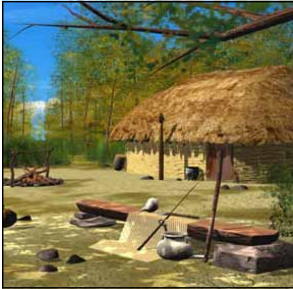
(above) An artist's depiction of ancient Ohio River Valley settlements.

Marietta/Washington County Convention and Visitors Bureau 121 Putnam Street Marietta, OH 45750 www.mariettaohio.org 800-288-2577 740-373-5178