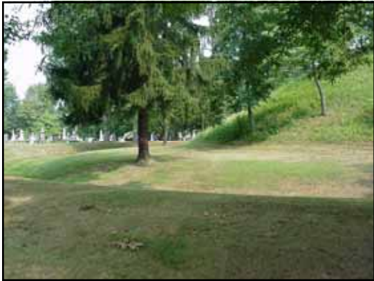
The Mound Cemetery on Fifth Street consists of a large, conical mound surrounded entirely by a mote-like ditch.